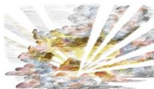
All Saints' Sunday