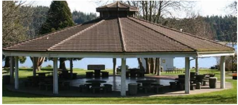
Our annual North Bay On The Bay Church Picnic was held on August 18th at the Gazebo at the Allyn Waterfront Park.