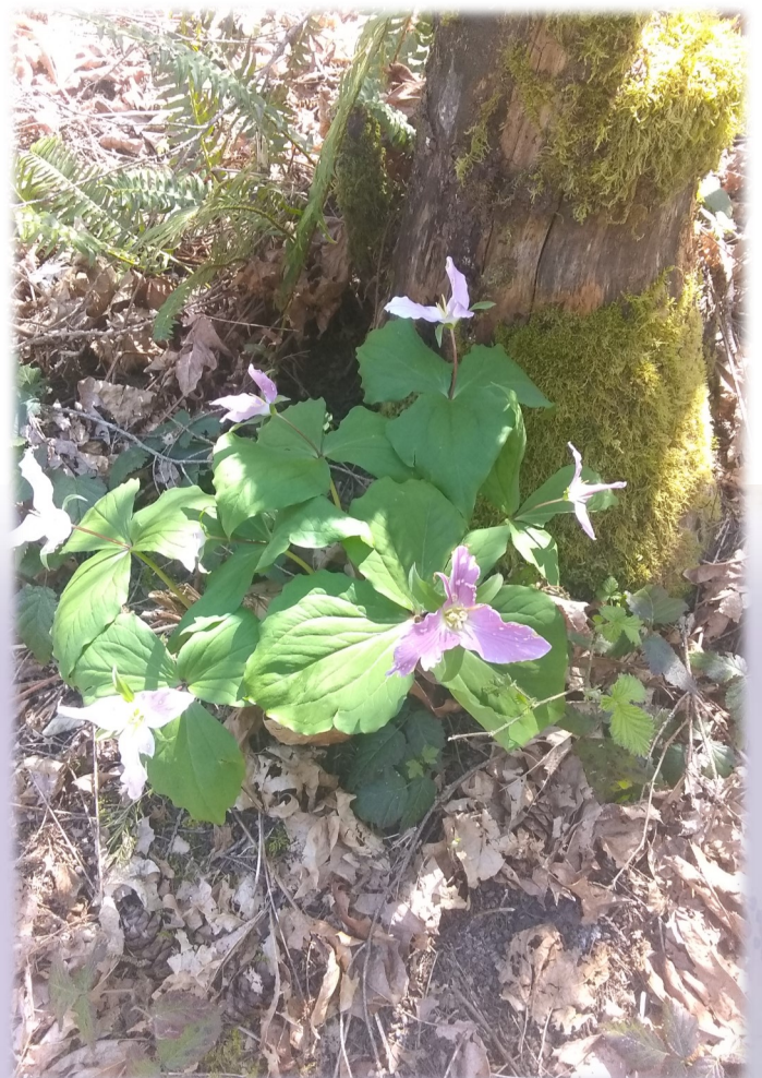
Resurrection and new life.